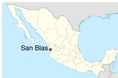
Location of San Blas in Mexico

Coordinates: 21°32′23″N 105°17′8″W ﻿ / ﻿ ﻿ / ﻿