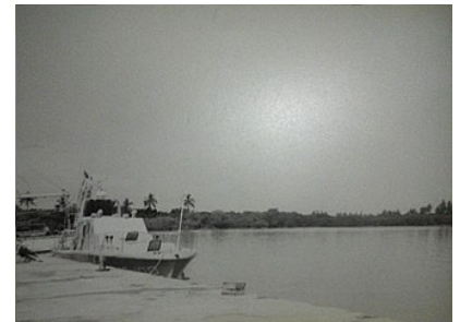
A dock in San Blas

During the 1900s, San Blas served as the arrival port for thousands of Yaqui men, women and children forcibly removed from their lands and sold into slavery. [10] At San Blas, these families were forcibly marched 200 miles to San Marcos and its train station. [10] Those who did not die on the march were sold into slavery at San Marcos, where they were deported to the sugar cane plantations in Oaxaca , the tobacco planters of the Valle Nacional , and the henequen plantation owners of the Yucatán for use as slave labor. [10] Most of the enslaved workers died within the first year of their captivity. [10]