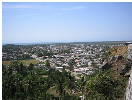
Panorama of San Blas