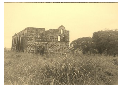
Ruins of a Colonial church on the Contaduría Hill, in San Blas