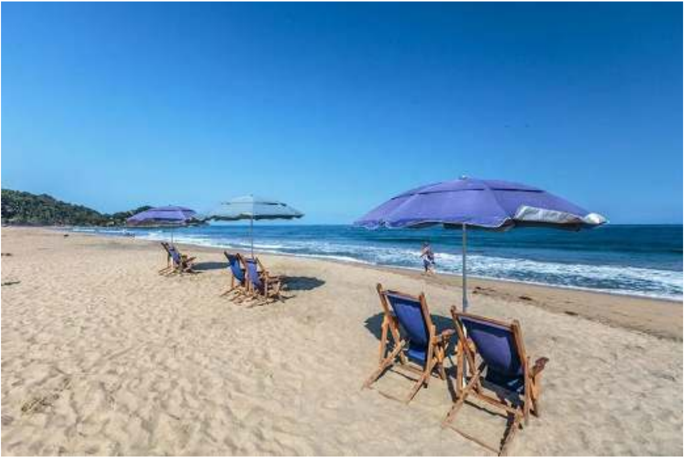
San Pancho beach chairs on the public beach