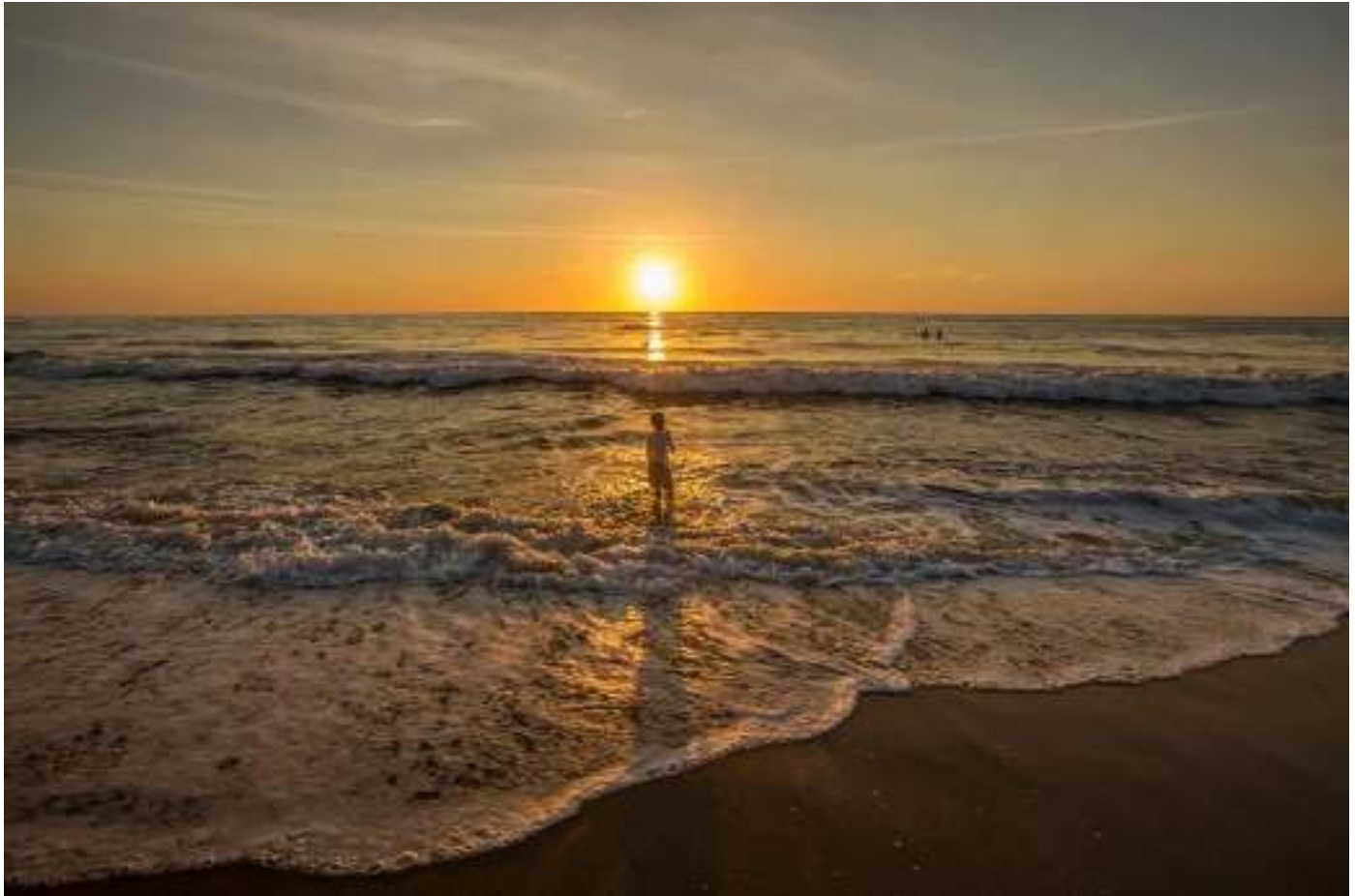
San Pancho Beach

However, it still conserves the same laid-back vibe and a strong sense of community.