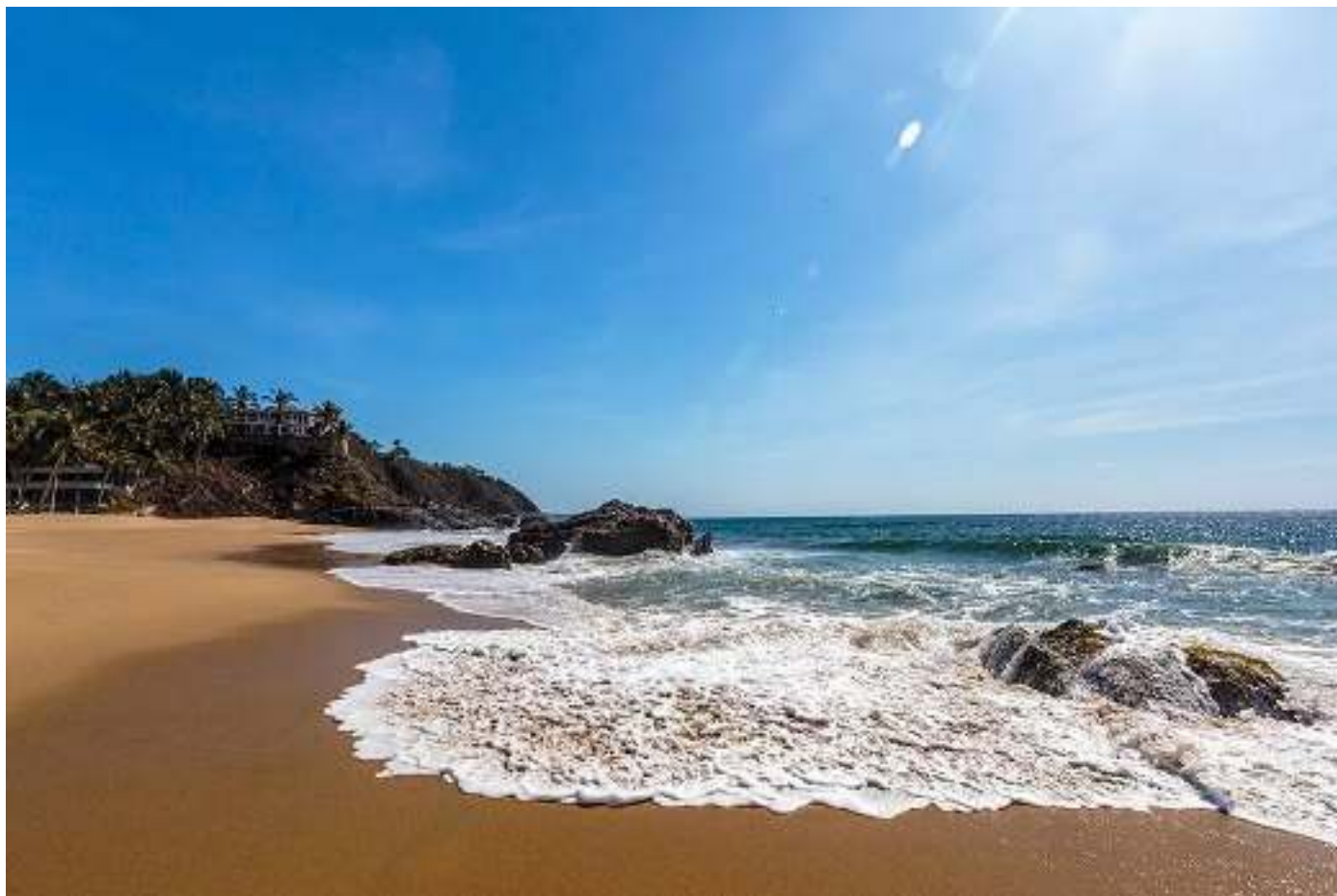
San Pancho beach day on the nearby bay