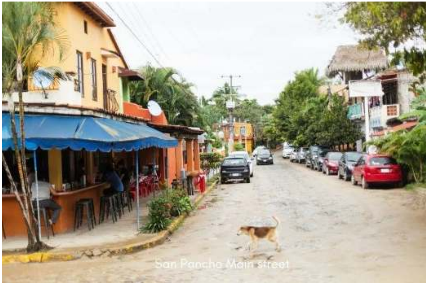
San Pancho Main Street