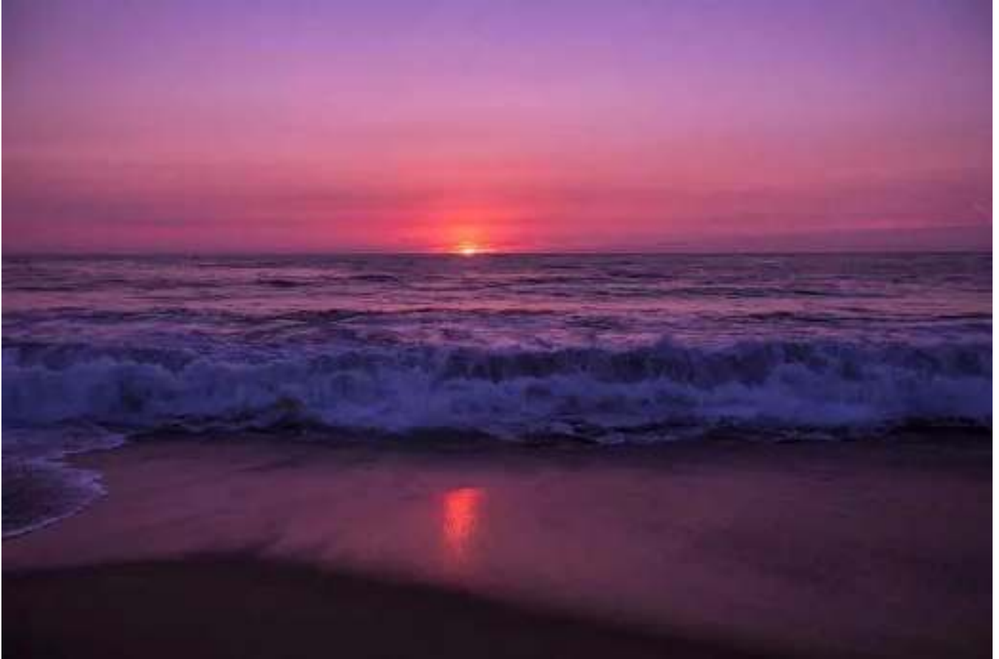
Sunset from San Pancho beach

Now, without further ado, here is a list of all the most amazing things to do in San Pancho, Nayarit, and in this post I will tell you all that I know about it.