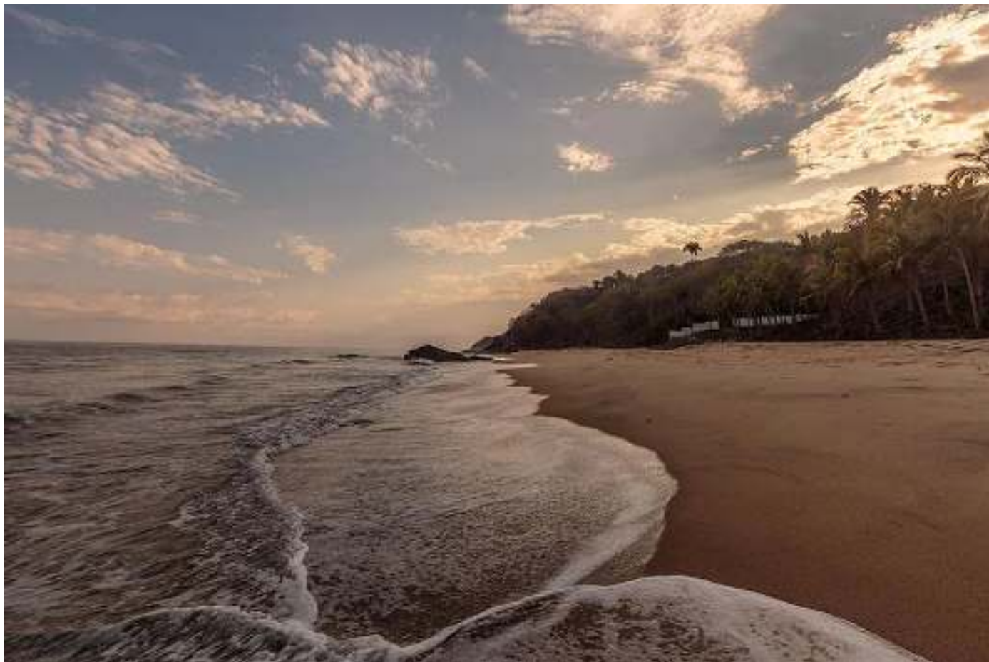
San Pancho beach almost Sunset

Sayulita fame goes way back much earlier than San Pancho's debut in the tourism scene. In fact, only 3 years ago San Pancho wasn't even on the map while Sayulita was thriving as the best surfing spot in Mexico and the party town.