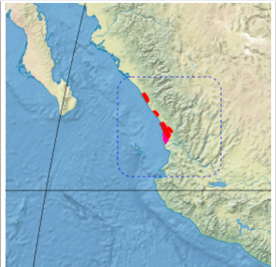
Ecoregion territory (in red)