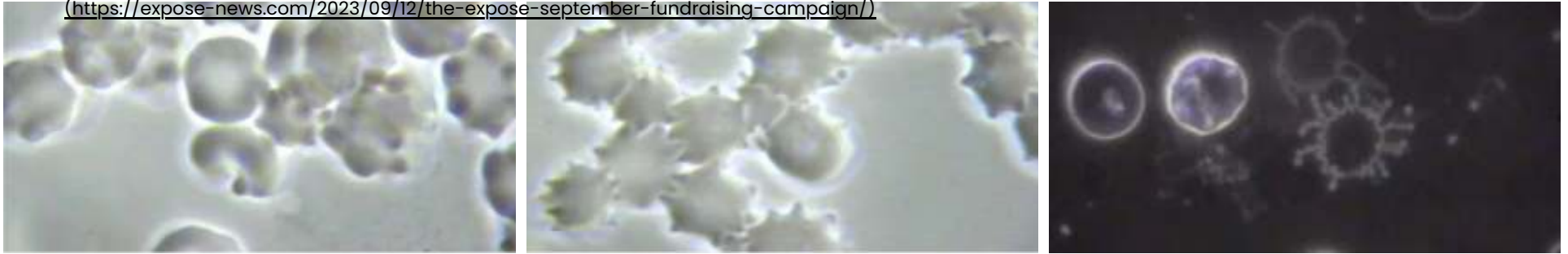
Scanning & Transmission Electron Microscopy Reveals Graphene Oxide in CoV-19 Vaccines

(https://expose-news.com/2023/09/12/the-expose-september-fundraising-campaign/)