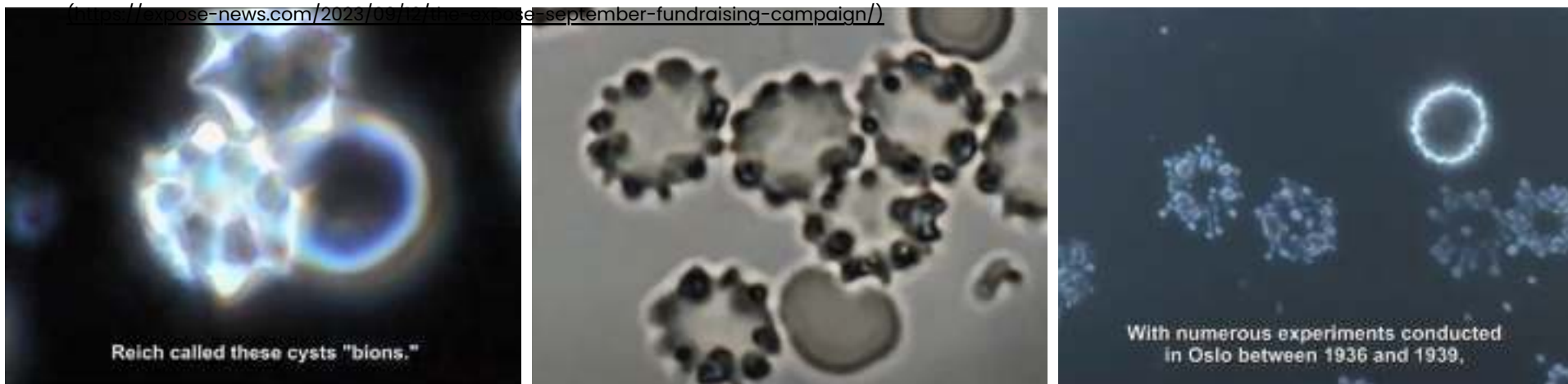
Reich Experimental Blood Test – Blood Disintegration

Decaying blood cells forming into what Dr. Reich called “bions” from the Reich Blood Test work done by Hericlitus Labs.